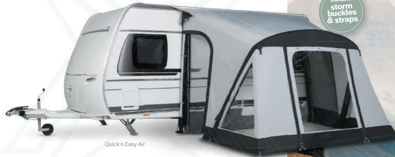
Quick'n Easy Air