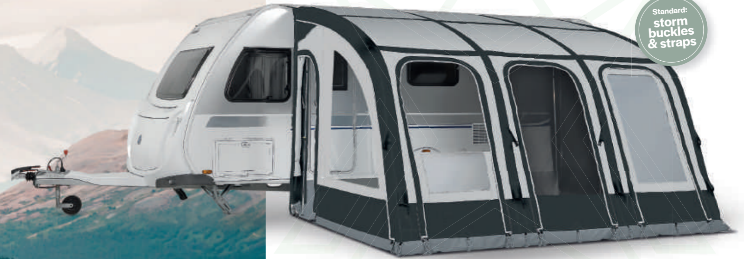
Magnum Airforce 390

Flexible combinations to suit your desired living space Free standing left and right AddExes