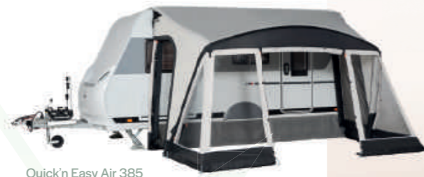
Quick'n Easy Air 385

225, 265, 325 & 385 Internal roll up privacy blinds